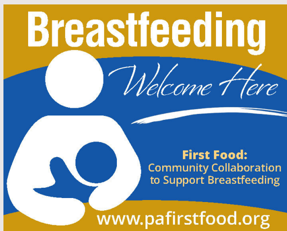
Window Cling 4in x 5in